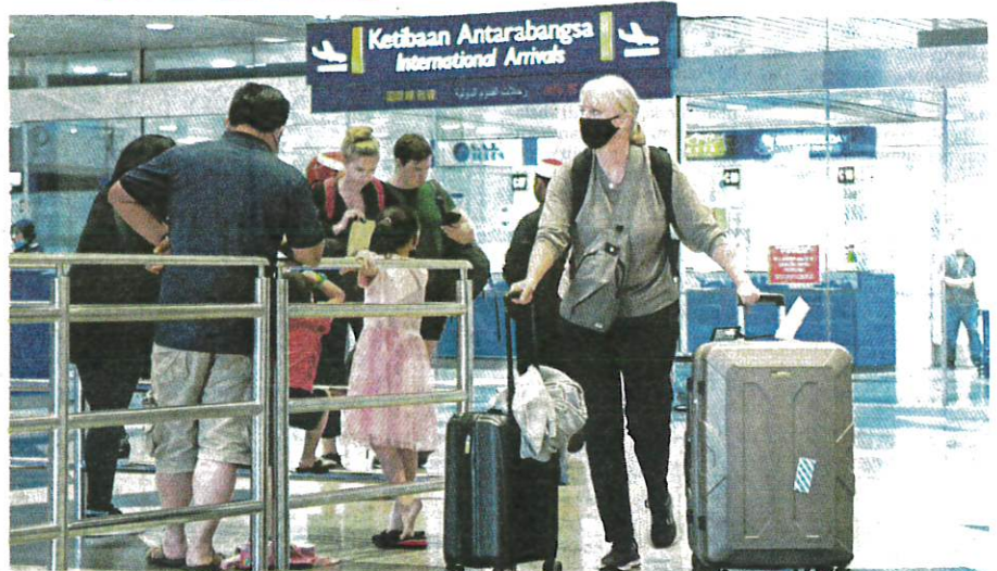
SOP yang dikenakan kepada pelancong yang tiba di Malaysia termasuk dari negara China adalah sama dengan ketibaan dari negara lain.